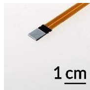
gSKIN ® -XM