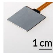
gSKIN ® -XI