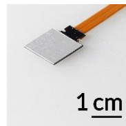
gSKIN ® -XP