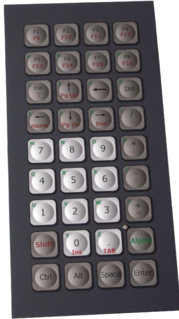
Panel mount version KBM36F1 Dim : 85 x 205 x 27,5 mm Weight : 0,1 kg

These 36 keys keyboards enable all major functions of a large MF keyboard in a small outline. Function keys F1 to F16 and complete upper and lower case alphabet are available. Distinct and easy recognition of the different functions due to three different legend colours corresponding with the mode-keys: black for UNSHIFT; red for SHIFT and green for ALPHA mode which is a toggle function indicated by a separate green LED.