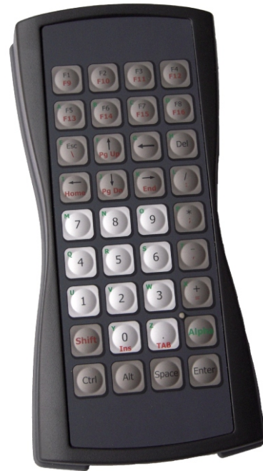
Enclosed version KBM36S1 Dim : 105 x 210 x 60 mm Weight : 0,3 kg