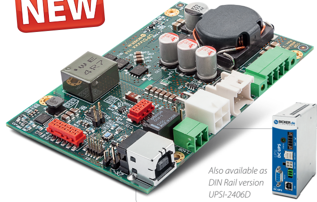
Also available as DIN Rail version UPSI-2406D